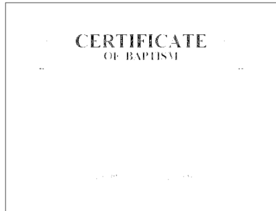
Bad Scan/Photo = Not Accepted

Once completing your Supplementary Information Form, please remember: