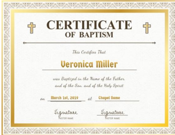
Good Scan/Photo = Accepted

Please see below for examples on what is acceptable