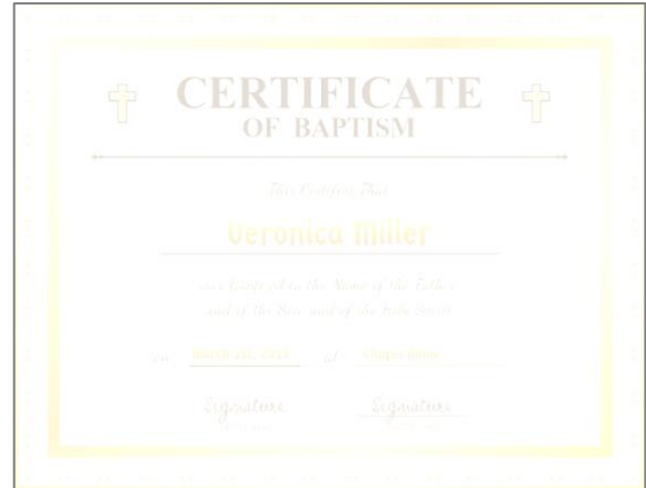
Bad Scan/Photo = Not Accepted