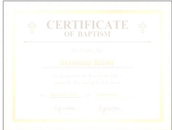
Bad Scan/Photo = Not Accepted