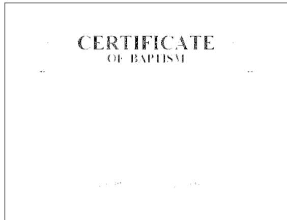
Bad Scan/Photo = Not Accepted

Once completing your Supplementary Information Form, please remember: